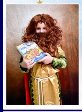
Today we celebrated All Saints Day to honor all the saints who lived heroically virtuous lives, offered their life for others, or were martyred for the faith, and who are worthy of imitation. Students dressed as their favorite saint and had a parade to church for Mass.