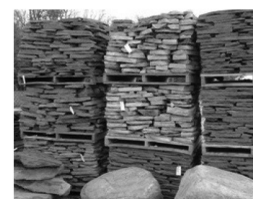
Natural Stone Yard