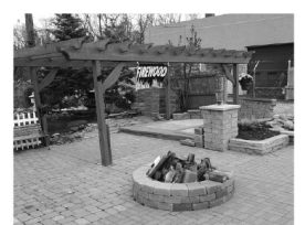
Decorative Brick Patios & Fire Pits