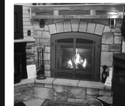
Fireplace Shop: Wood & Gas

www.American-Home.com • 1270 Mentor Ave. • Painesville Twp. • Across from Lake County Fairgrounds