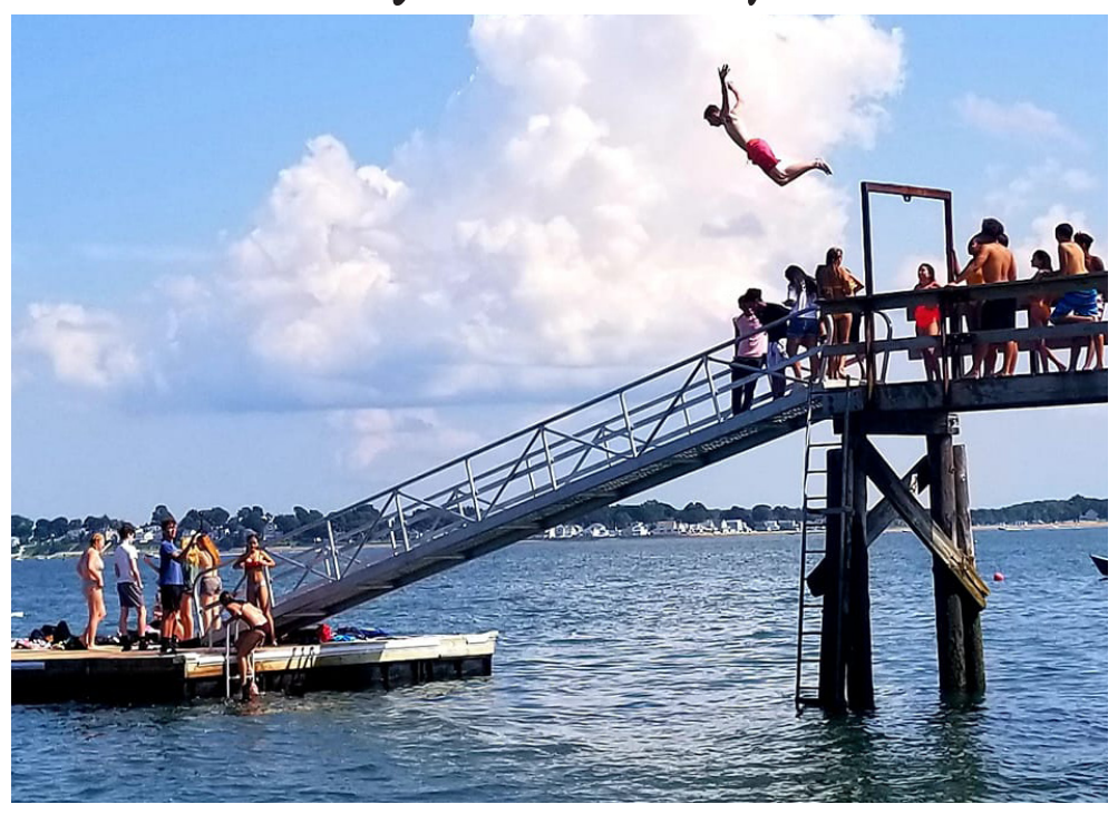
During the recent Heat Wave & Like generatons before them the youth of Houghs Neck enjoy the cool ocean waters and jumping the PL Facebook photo posted by Kirsten Chambers-Taylor