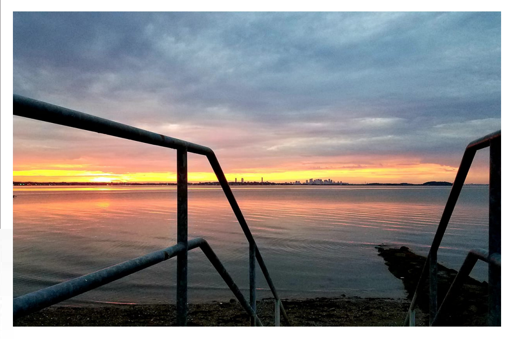
July 31st from the Willows at Sunset