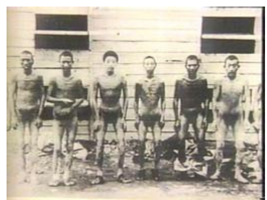
GHQ photo of liberated Chinese at Hanaoka (NHK Special)

"Measures for Controlling Imported Chinese Workers," general directives issued by the Interior Ministry in April 1944, show that police were acutely worried about escapes and organized rebellions. The Chinese were to be quarantined and separated at all times from the Korean conscripts and Allied POWs who frequently performed forced labor at the same industrial sites, as well as from local Japanese. In June 1944, based on the so-called "Honma recommendations," the Interior Ministry issued more draconian guidelines called "Reference Documents for Use of Chinese Workers."