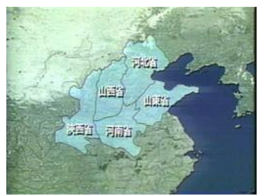
Region of North China where forced laborers were obtained: Hebei, Shanxi, Shandong, Shaanxi, Henan provinces

Companies submitted their numerical requests for Chinese manpower to the Welfare Ministry, which in turn consulted with the Munitions Ministry and Transportation Ministry to determine allotments. Then the Beijing-based North China Labor Association (NCLA), staffed mostly with Chinese after having been set up by the Japanese Embassy and Imperial Army, oversaw the procurement, detention and shipment of workers to Japan. The forcible deportations were carried out over a 25-month period ending in May 1945. Some 90 percent of workers were obtained via the NCLA, according to the FMR, mostly through the vaguely defined method of "administrative provision" that grew increasingly violent over time and is discussed below.