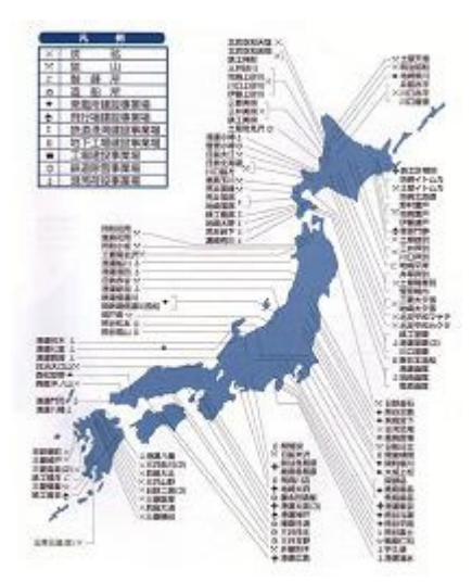
Map of all 135 Chinese forced labor sites, prepared by plaintiffs' lawyers

NHK's survey was conducted before the Chinese government gave the go-ahead in 1995 for its citizens to sue in Japan, and well before the main wave of CFL lawsuits appeared after 2000. The survey results suggested grounds for cautious optimism, but courtroom outcomes and the recent hardening of corporate attitudes have dashed expectations.