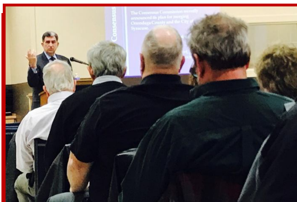
Geddes Town Hall, March 16, 2017

*In the comments my respondents specified that they were for shared services, but not governance. And most only wanted a few changes at first.