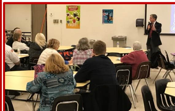
Henninger High School, March 9, 2017