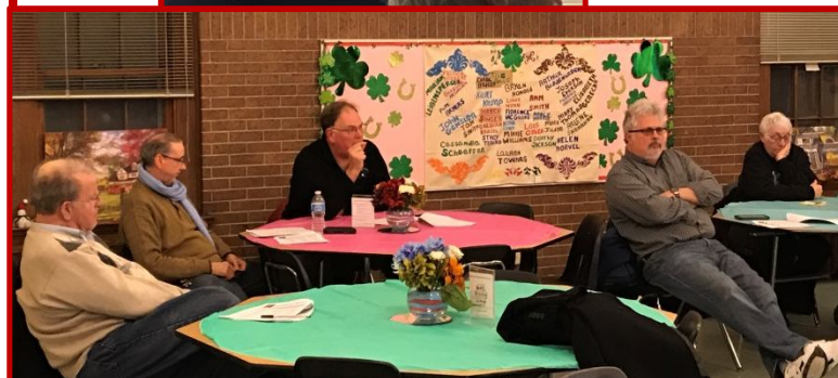
Cecile Community Center, March 2, 2017