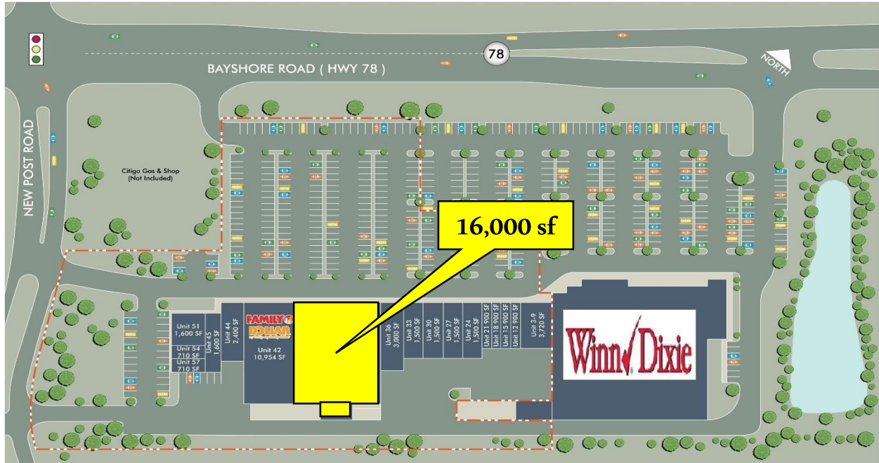
FOXMOOR SHOPPING CENTER