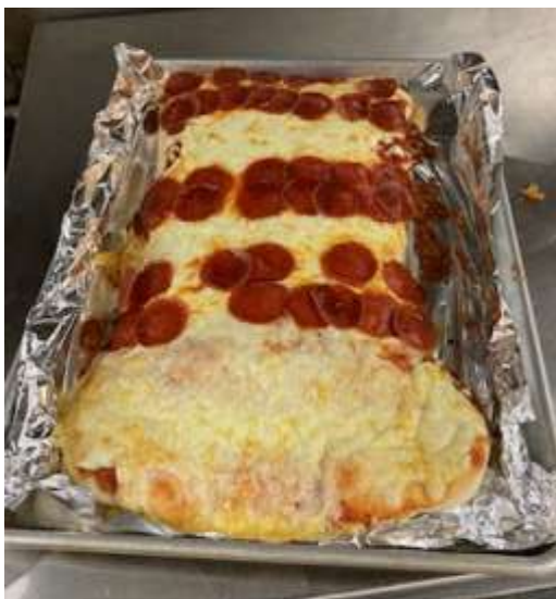
Cat in the Hat Pizza