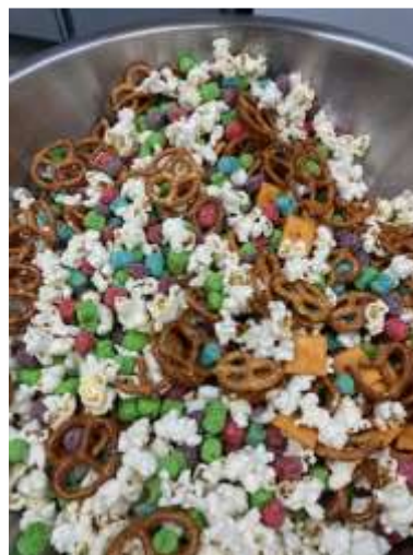
Hop on Pop - Popcorn