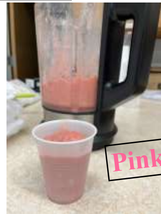
Pink Ink Drink