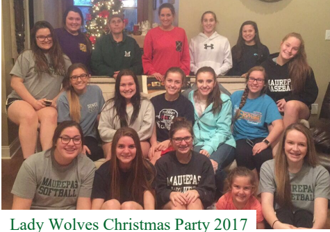
Lady Wolves Christmas Party 2017