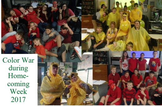
Color War during Homecoming Week 2017