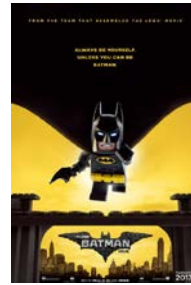
The Lego Batman Movie February 11, 2017

Don't miss the next Sensory Friendly Film!