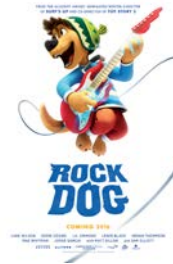
Rock Dog February 25, 2017