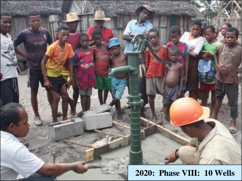
2020: Phase VIII: 10 Wells