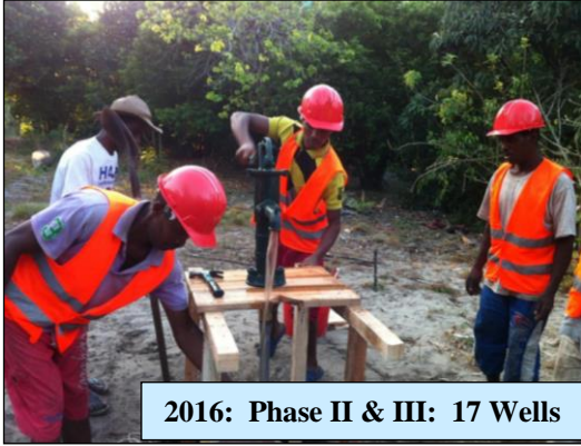
2016: Phase II & III: 17 Wells