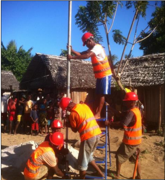
2017: Phase IV & V: 21 Wells