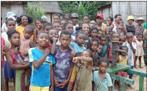
2019: Phase VII: 42 Wells