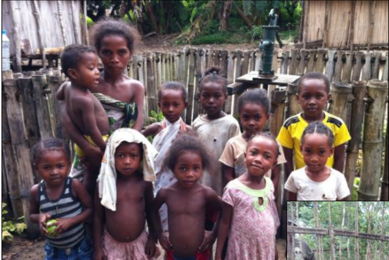
2015: Phase I: 5 Wells