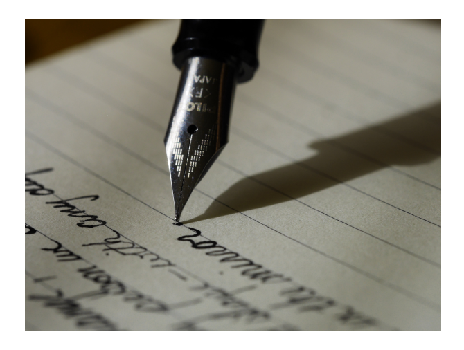
For high school graduates class of 2019