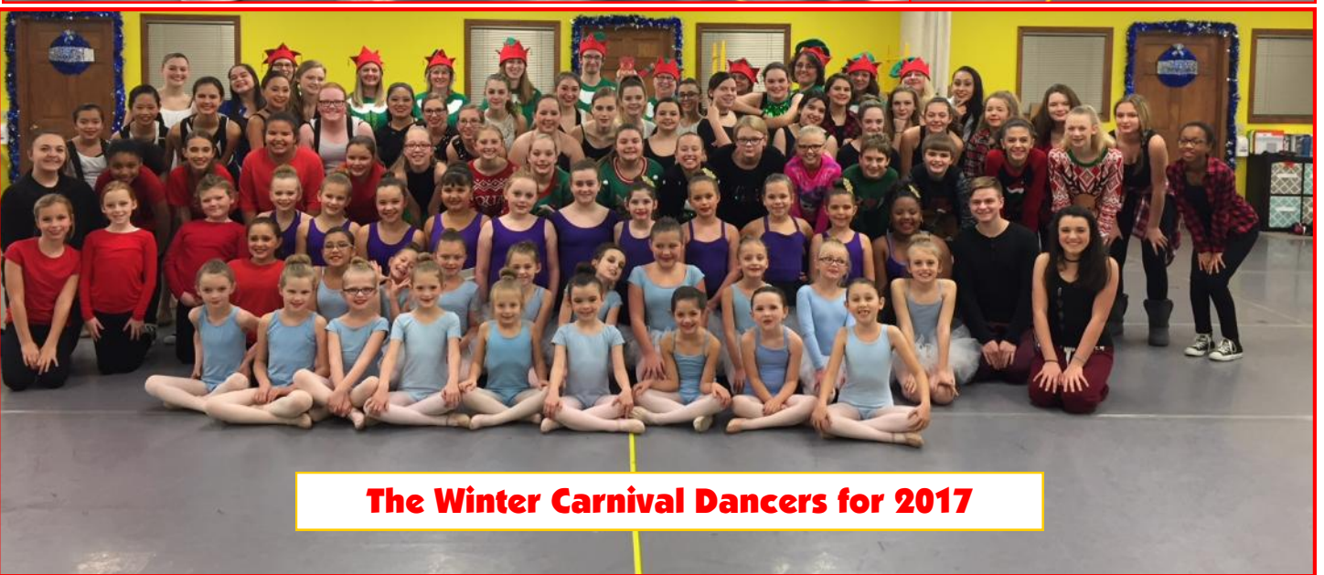
The Winter Carnival Dancers for 2017