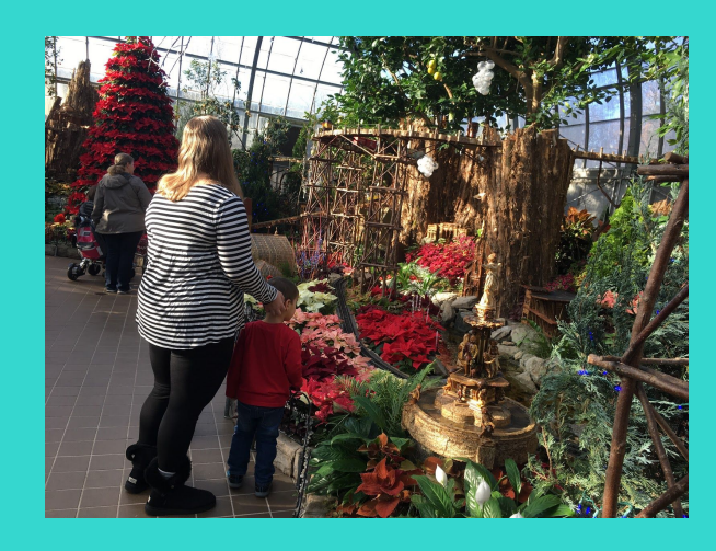
Thanks for sharing some of your December with us!