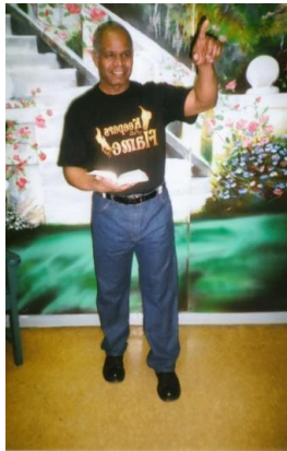
Minister Isaiah Vining Jr.