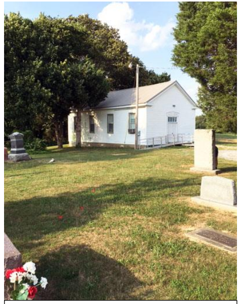
Church of Sharon. The first Presbyterian Church in Illinois. Founded in 1816. Photograph by Bill Harshbarger, 2016.

Through their history, the congregation built four structures for worship. They set up the last church at a cemetery and next to the stagecoach road. Services continued there until 1987, when the structure no longer worked for the congregation. However, in 2010 the community restored the building and reopened it for special services. Tourists today—two hundred years after the Church of Sharon began—can find it 3 ½ miles south of the Enfield intersection and 3 miles north of Norris City. Those using U. S. 45 can turn east on County Road 1050 North, travel about one-half mile, and turn left on a lane.<sup>10</sup>