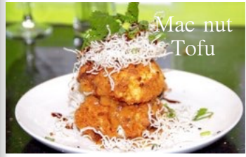
Mac nut Tofu