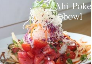
Ahi Poke bowl