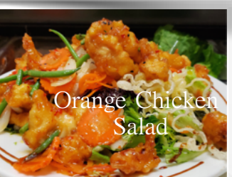
Orange Chicken Salad