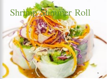
Shrimp Summer Roll