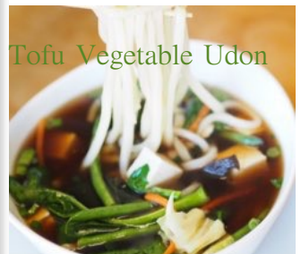
Tofu Vegetable Udon