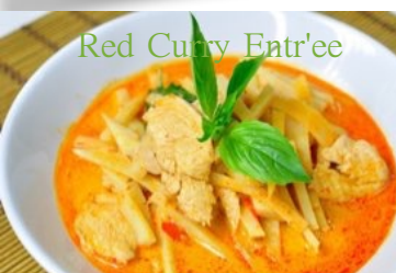
Red Curry Entr'ee