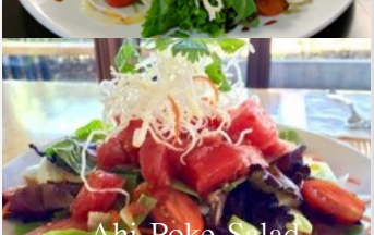
Ahi Poke Salad