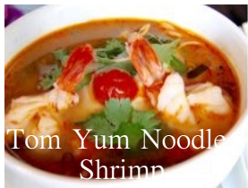
Tom Yum Noodle Shrimp