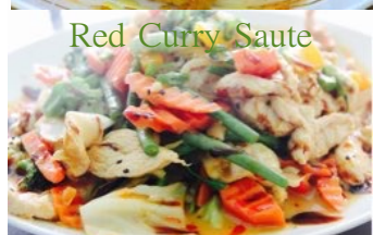
Red Curry Saute