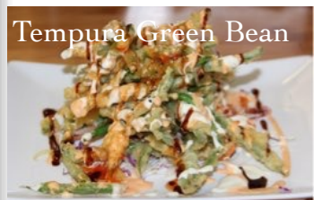
Tempura Green Bean