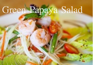
Green Papaya Salad