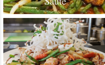
Kung Pao Chicken