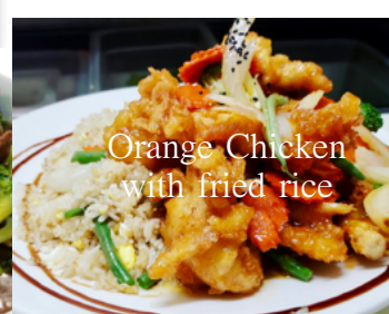
Orange Chicken with fried rice