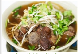
Oxtail Noodle Soup