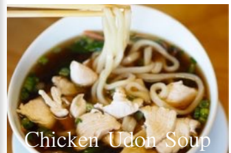
Chicken Udon Soup