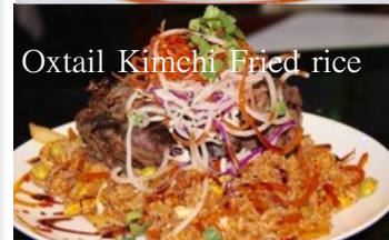
Oxtail Kimchi Fried rice