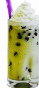
Jasmine Green Tea