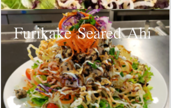
Furikake Seared Ahi