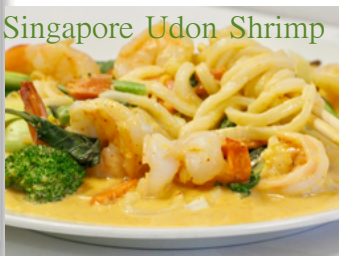
Singapore Udon Shrimp