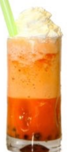
Thai Tea Boba