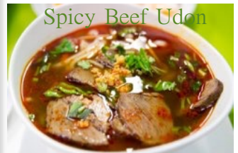
Spicy Beef Udon