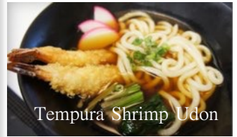
Tempura Shrimp Udon