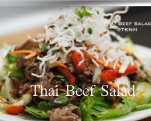
Thai Beef Salad