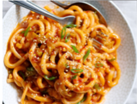
Kimchi Udon Saute