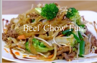
Beef Chow Fun