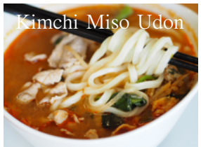
Kimchi Miso Udon