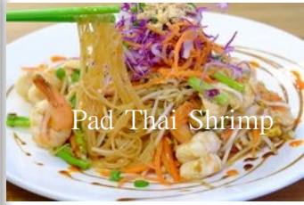
Pad Thai Shrimp