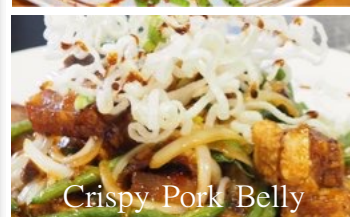
Crispy Pork Belly Saute