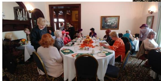
Lovely Ladies Around the House