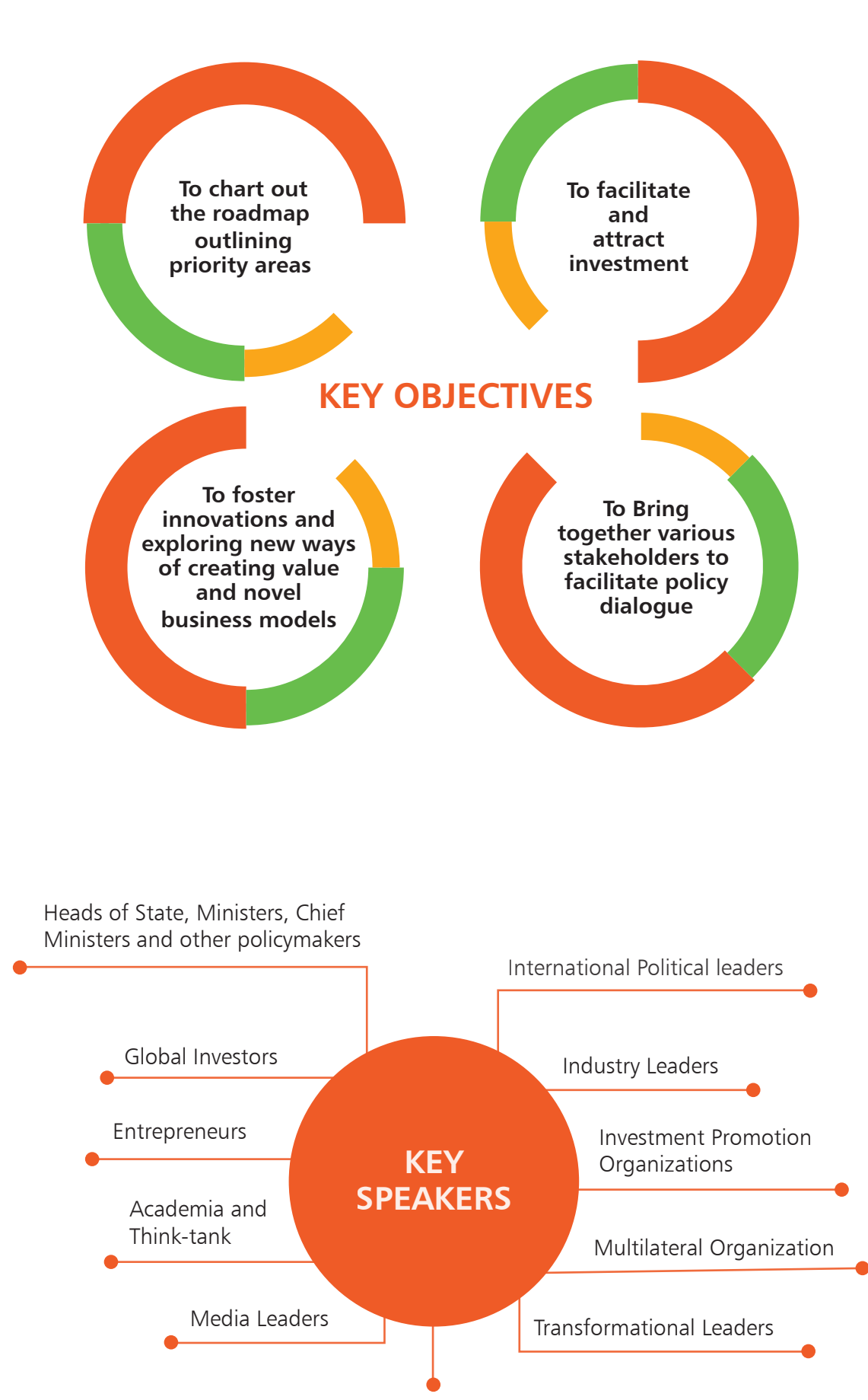
Social Icons and Young Leaders