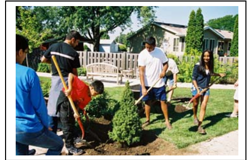
IndUS youth planting a tree at Evergreen Retirement Community, Oshkosh.

We will continue to collaborate with organizations such as India Association (N.E.W.), Toward Community, Human Relations Council, and areas schools and colleges in organizing activities that promote inter-cultural understanding.