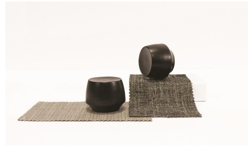
Hugo in Black