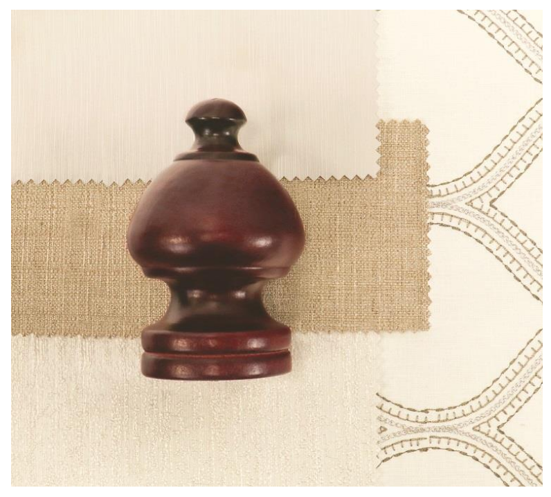
Sherwood in Mahogany