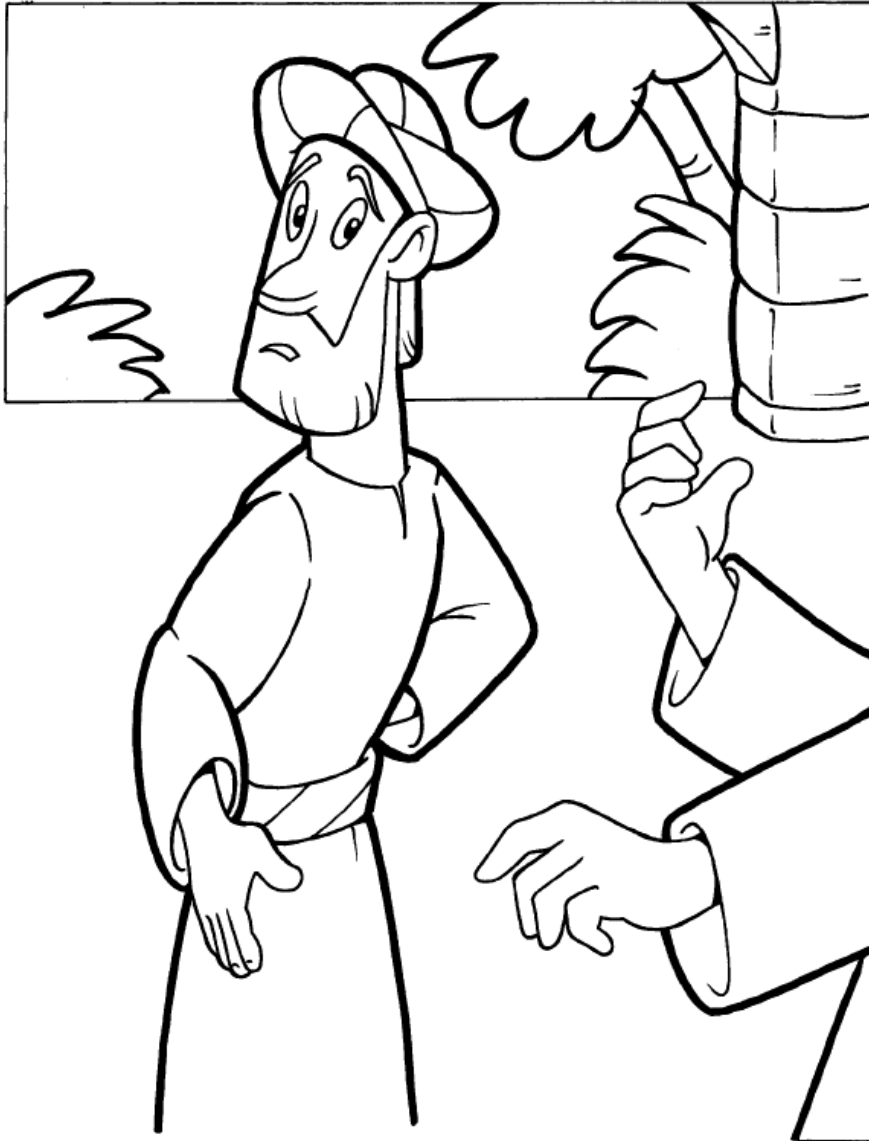
The Rich Young Ruler