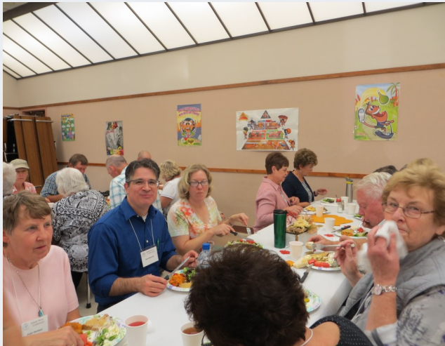
Having dinner at Mission Center Conference