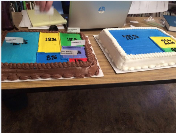
A budget presentation you can sink your teeth into