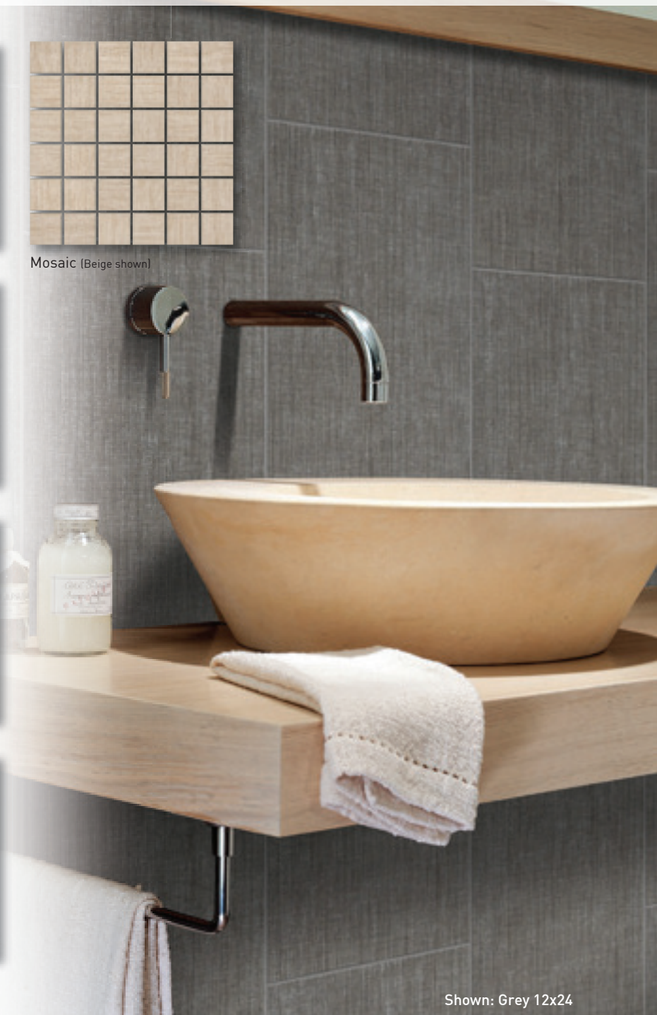
Shown: Grey 12x24