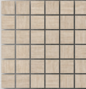
Mosaic (Beige shown)