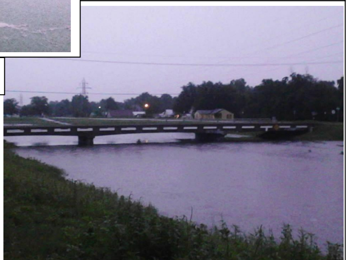
Cow Creek & 11 th Street (Usually you would see trickle to near nothing here!, Walk/Bike path is under water & out of sight! ☹)

~ "Water, Water Every Where, Nary A Drop To Drink!" ~