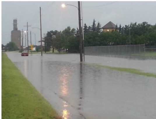
Heavy rain causes flooding, evacuations http://www.hutchnews.com/Latestlocalnews/Heavy-rain-causes-flooding--evacuations2013-08-04T13-00-49

Conklin Cars – 11 th & K-61 First Hail Now Flooding!