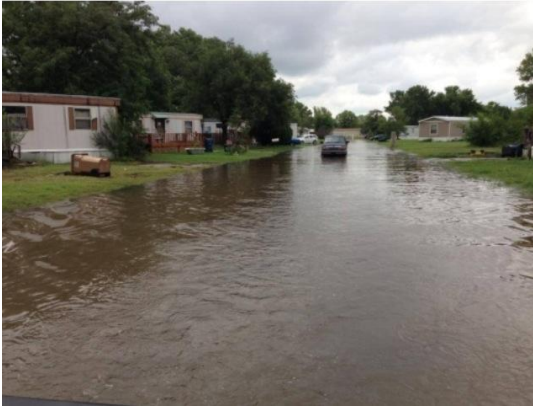
Floodwaters prompt evacuation of mobile home park http://www.hutchnews.com/Latestlocalnews/mobile-home-evacuees

Hutchinson residents told to stay home because of flooding (KWCH TV) Video, Pics, Story & More: http://www.kwch.com/news/kwch-extreme-flooding-in-reno-barton-counties-20130804.0.7906914.story