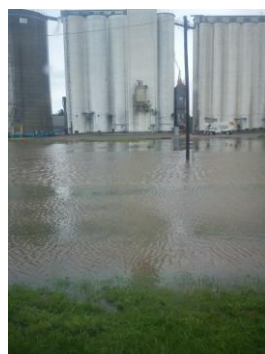
Nick Blvd & Main, Nickerson

Would you believe we are still technically in a drought? Yup!