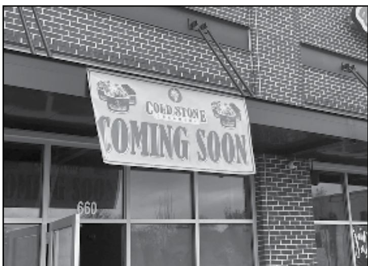
Cold Stone Creamery is coming to Hugh Howell Marketplace. Cold Stone joins Gusto as the two latest build outs in the new center.