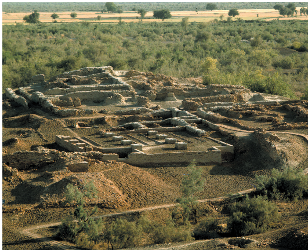
Mohenjo-daro existed at the same time as the civilizations of ancient Egypt, Mesopotamia and Crete.

"No firm information is available about its underlying language."