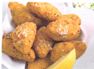
Crispy Fried Artichokes