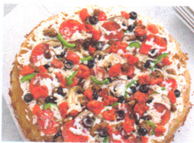
BJ's Favorite Deep Dish Pizza

Valid for dine in or take out. Not valid towards alcoholic beverages or Happy Hour specials. Please do not distribute flyers on-site during the event. Flyers must be printed and presented to the server.