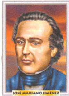
Jose Mariano Jimenez

This is the third article in the series about the individuals who started and played a large part in the Mexican Revolution of 1810. In this piece we will learn about two more Mexican Patriots Jose Mariano Jimenez and Jose Mariano Abasolo Outon who were instrumental in the Revolution.