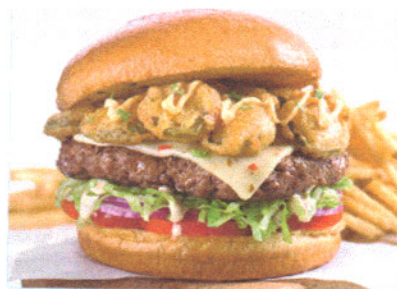
Crispy Jalapeño Burger