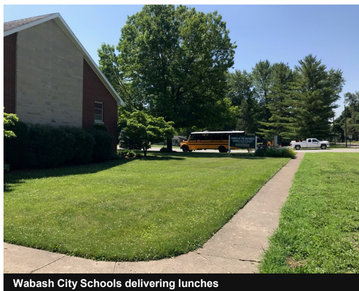
Wabash City Schools delivering lunches

We welcome all who are on the journey to know Jesus, who share in his love and who choose to embrace the diversity within this community of believers. As individuals we may be at different places along the path, but as a community, we are all traveling together in faith, trusting God to show us the way.