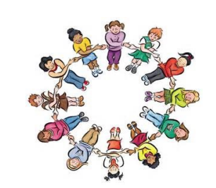
Story Circle is for children kindergarten age and younger.