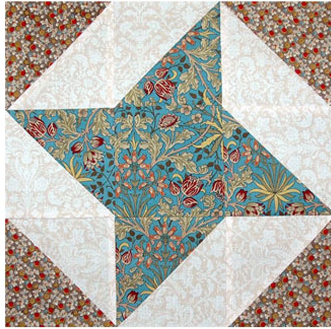
Friendship Star Quilt Block Variation. Janet Wickell

The most basic Friendship Star quilt block has squares in its corners —this version replaces the squares with half square triangle units. Triangles are the perfect shape for the corner positions because they add a burst of color when blocks are sewn together.