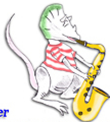
Grover (triceratops + mouse = triceramouse)

Half a Dinosaur + Half an Animal = The Radisaurs!