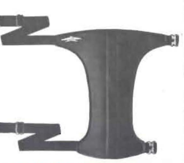
A G-30 Professional I Lightweight with the added protection of a single-steel spine. This two strap professional model has top grain leather and suede lining.

A G-60 Junior Olympic Three strap design with patented fasteners. Long and made to bend at the elbow for extra comfort.