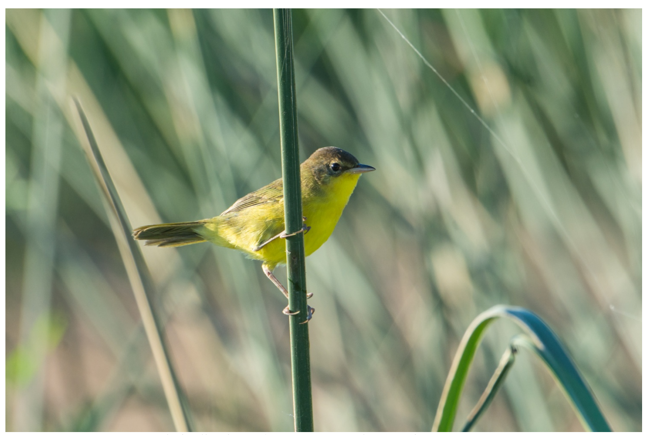
Masked Yellowthroat (f) [Reserva Natural Otamendi, Buenos Aires]