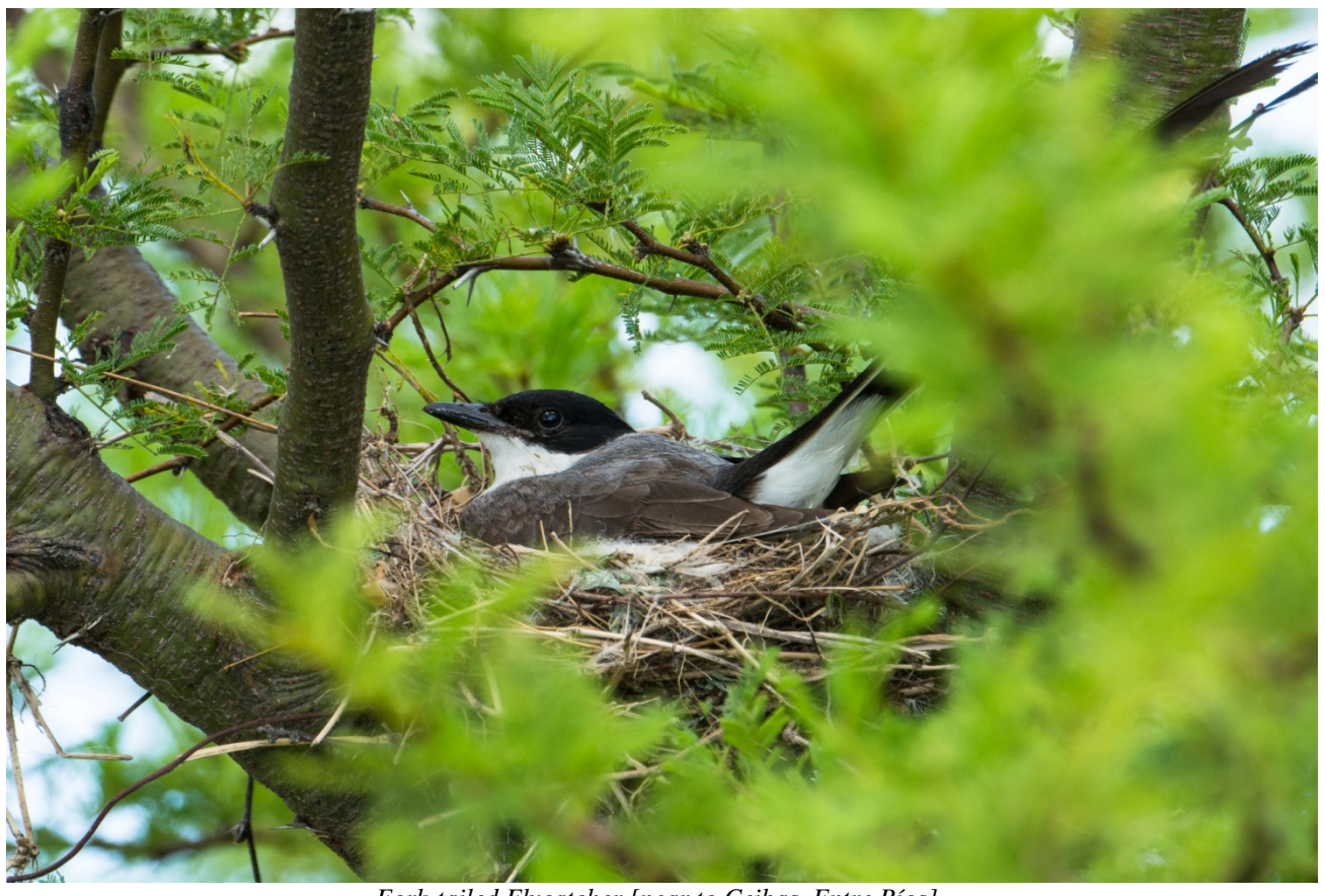
Fork-tailed Flycatcher [near to Ceibas, Entre Ríos]