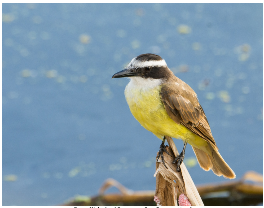
Great Kiskadee [Costanera Sur, Buenos Aires]