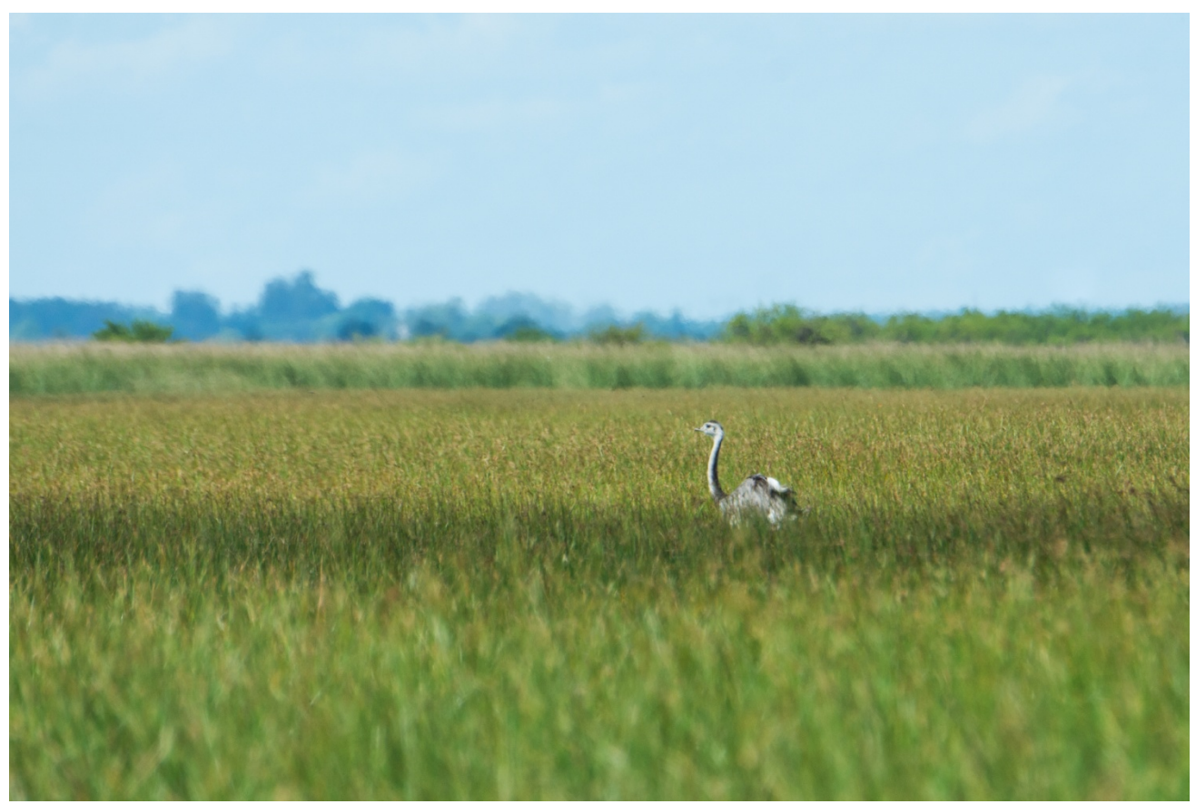
Greater Rhea [near to Ceibas, Entre Ríos]

Although the start to our day in Entre Ríos was inauspicious (our 2WD vehicle was unable to pass through the muddy roads en-route to our intended target habitat in the vicinity of Perdices) and the very warm and sunny weather somewhat suppressed bird activity (and sapped our energy levels) during the middle of the day, we saw many interesting species during some 8 hours of birding from local dirt roads. The roads cut through marginally higher and drier country then I had visited with Marcelo in December and highlights included a Glaucous-blue Grosbeak (encountered as be turned back from our failed mission to reach Perdices), 5 Greater Rhea (seen in open country west of Ceibas), large numbers of Southern Screamer and storks (including one Jabiru - a first for Marcelo in Entre Ríos, and apparently one of few records in the province), several Firewood-gatherers (the bird itself is not as spectacular as its unusual name) and three species of pipit. On the way back to Buenos Aires we wrapped up with a late-afternoon bonus stop at the Reserva Natural Otamendi in Buenos Aires province. Highlights there included views of a pair of Rufouscapped Antshrikes and a Freckle-breasted Thornbird, however we could not locate the Straight-billed Reedhaunters that finally started singing at dusk.