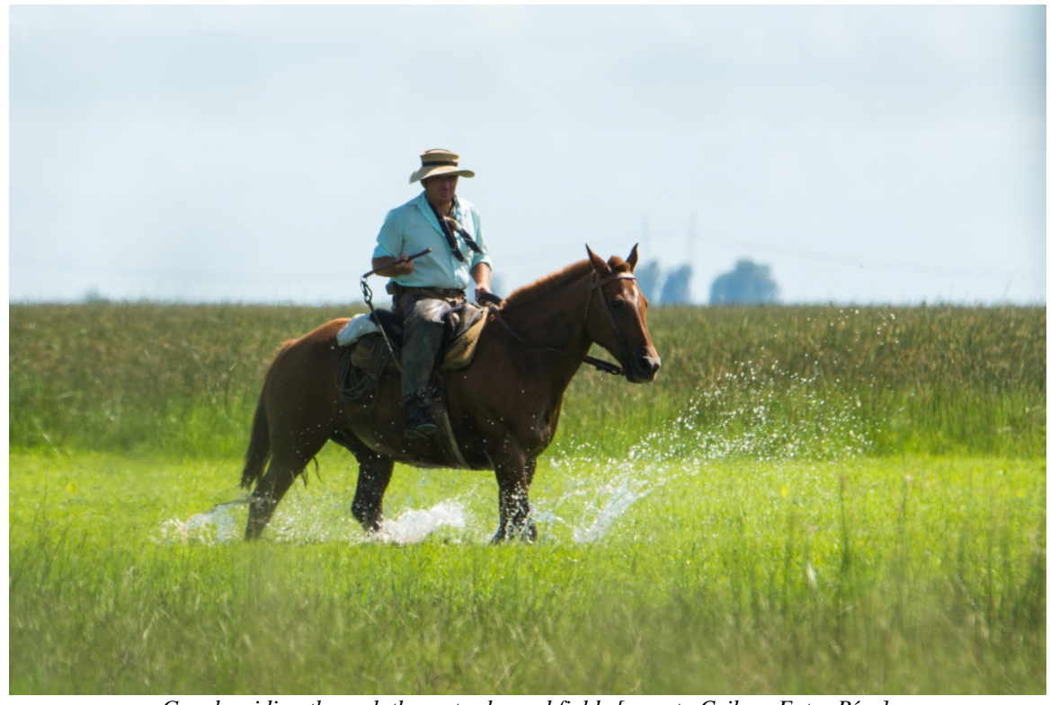
Gaucho riding through the water logged fields [near to Ceibas, Entre Ríos]

Overall, I identified a combined total of 114 species in Buenos Aires city together with Buenos Aires and Entre Ríos provinces. 103 of these were encountered without use of playback during the day trip to Entre Ríos (coincidentally exactly the same number of species as identified there during my December visit) including 14 lifers, and 46 during my visits to Costanera Sur (all but 11 of which were also seen on the day trip outside the city). A combined trip list is included at the end of this report.