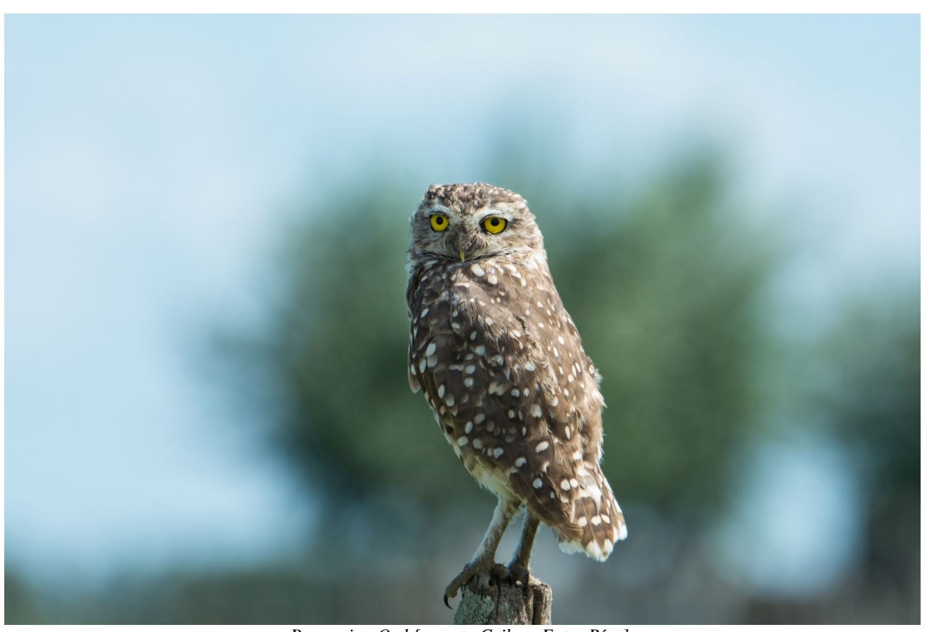
Burrowing Owl [near to Ceibas, Entre Ríos]