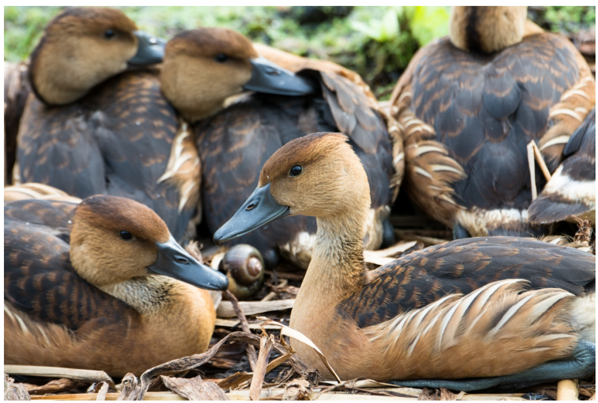
Fulvous Whistling-Ducks (juveniles) [Costanera Sur, Buenos Aires]

Overall, I identified a combined total of 114 species in Buenos Aires city together with Buenos Aires and Entre Ríos provinces. 103 of these were encountered without use of playback during the day trip to Entre Ríos (coincidentally exactly the same number of species as identified there during my December visit) including 14 lifers, and 46 during my visits to Costanera Sur (all but 11 of which were also seen on the day trip outside the city). A combined trip list is included at the end of this report.