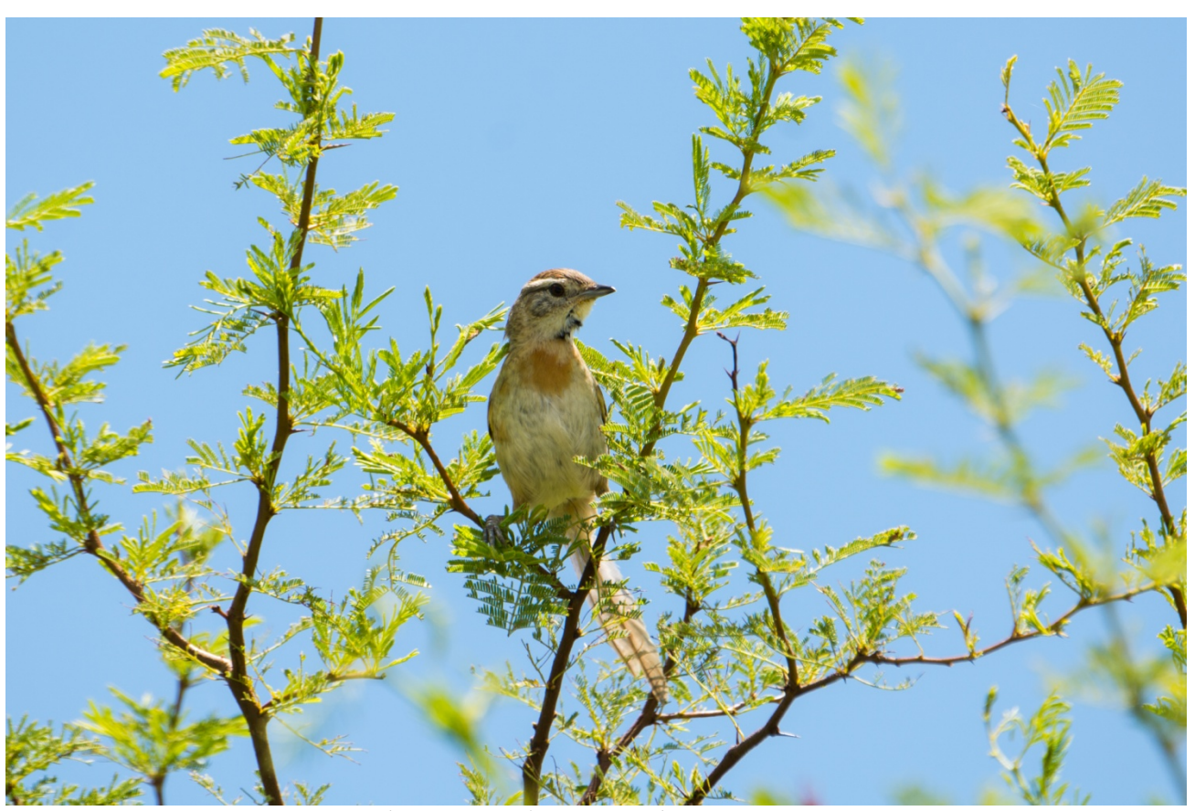
Chotoy Spinetail [near to Ceibas, Entre Ríos]