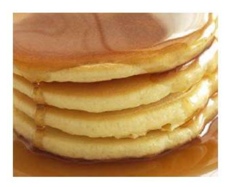
Pancake Supper Shrove Tuesday February 13<sup>th</sup> 2018 Leubin-McCray Hall