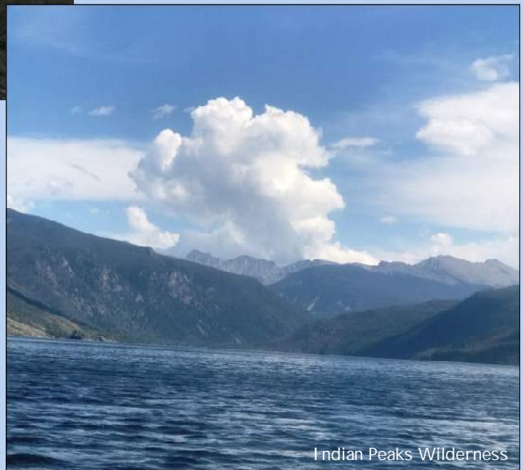
Indian Peaks Wilderness