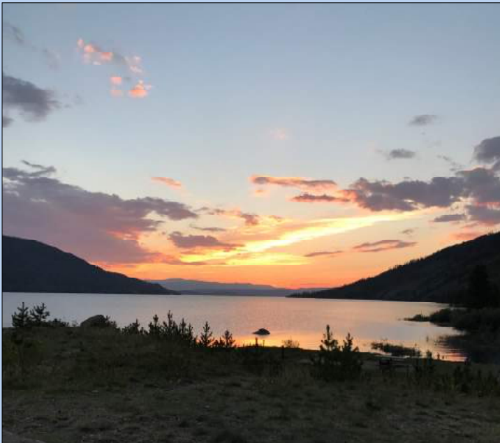
Granby is bordered by Rocky Mountain National Park and the Indian Peaks Wilderness