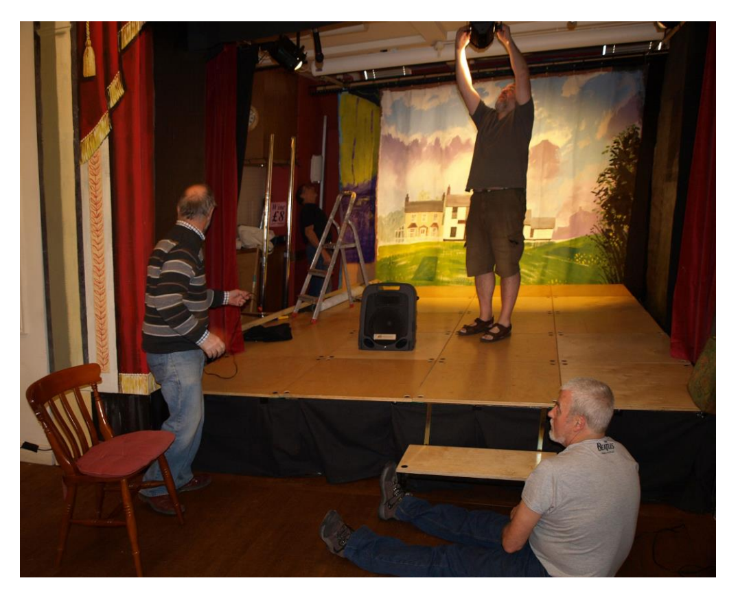
Erecting the stage, Toft in Space pantomime 2010