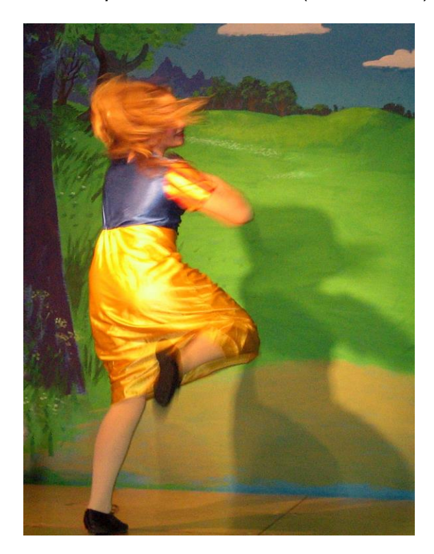
Victoria Unsworth dances, Toft pantomime 2006