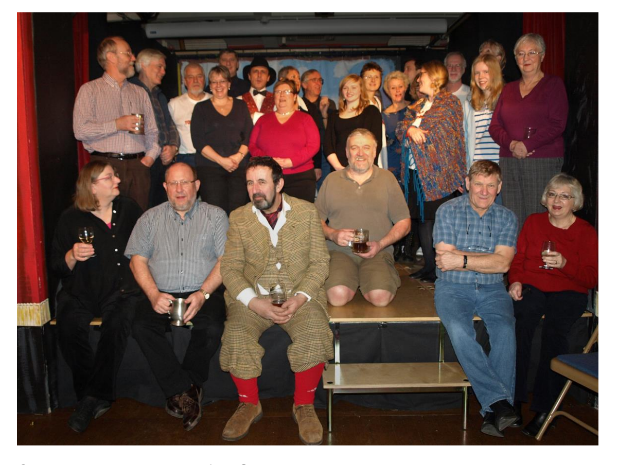
Cast and helpers' party Toft in Space 2010