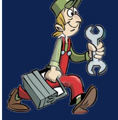
copywrite Frisco illustrationsOf.com/89401

The other bolt is "special" only because it is only 11/16" long. This allows the bolt to lock the spring in place, without having the bolt actually touch the starter shaft. Don't be tempted to use a 3/4" long bolt instead of the correct shorter one. See the comparison photo of a 3/4" bolt and the correct bolt.