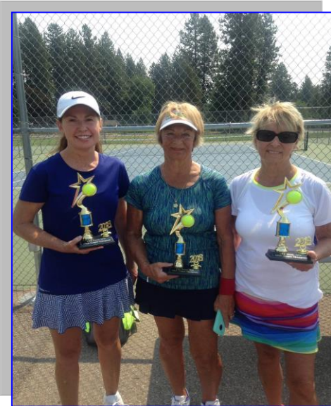
A few players from the 2018 Champs - Topspin Terrors.

Coeur d'Alene Tennis Association, P.O. Box 3002, Coeur d'Alene, ID 83816-3002 www.cdatennis.org info@cdatennis.org