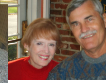
A few more Christmas Party shots —