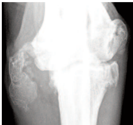
an xray of severe osteoarthritis in a Labradors elbow secondary to elbow dysplasia that was successfully treated with stem cell therapy

Regenerative medicine is defined as "the process of replacing, engineering or regenerating cells, tissues or organs to restore or establish normal function". In the veterinary field we are using the body's own repair kit to enable us to do this.