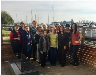
CDAA Board enjoy the harbor

* The Dental Board has voted to permanently eliminate the RDA Practical Exam, which means that only the written exam/s will be required now.