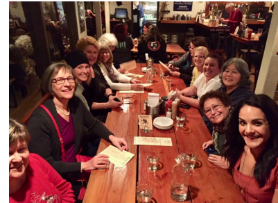
Fun & food following Board Meeting