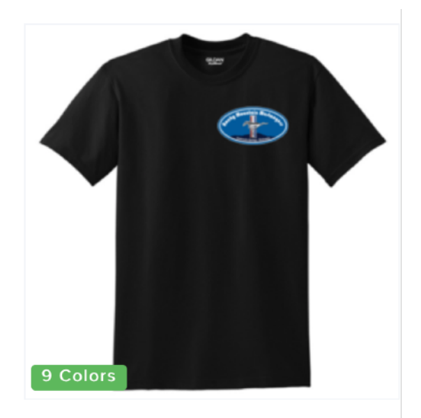
Gildan - DryBlend 50 Cotton/50 Poly T-Shirt $12.00