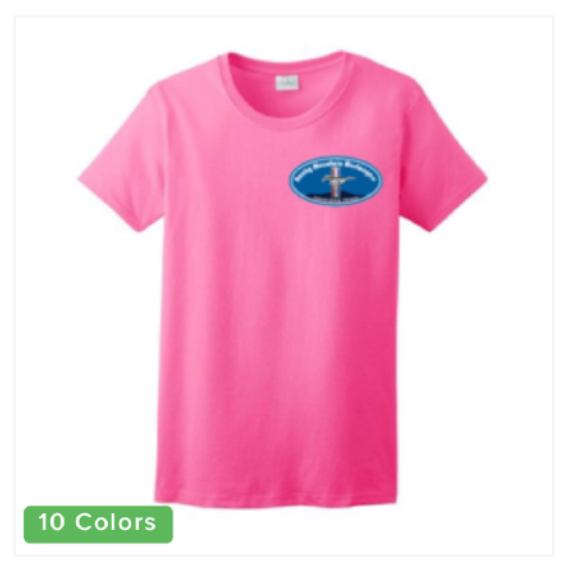
Gildan ® - Ladies Ultra Cotton ® 100% Cotton T-Shirt $12.00