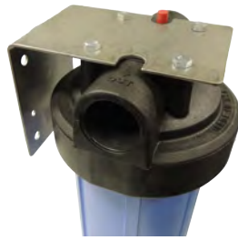
Optional Mounting Bracket