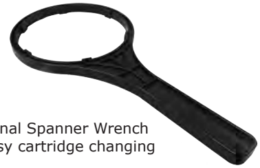
Optional Spanner Wrench for easy cartridge changing