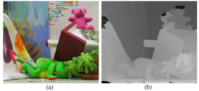
Fig. 1. (a) The color image Teddy and (b) its depth image obtained by [10].

Image contrast enhancement techniques have been studied in the past decades. There are various contrast enhancement methods are there. Among those, histogram modification methods have received the greatest attention because of their simplicity and effectiveness. Since global histogram equalization over-enhance the image details, an alternative to this, the approaches of dividing an image histogram into several sub-intervals and modifying each sub-interval separately. The effectiveness of these sub-histogram based methods is dependent on how the image histogram is divided. The histogram of a image is obtained by using the Gaussian mixture model (GMM) and divides the histogram using the intersection points of the Gaussian components. The divided sub-histograms are then separately stretched using the estimated Gaussian parameters. Now a days technic of the color image enhancement have been found using depth [4]–[6] or stereo [7]–[9] as side information. Stereo matching algorithms and depth sensors are providing accurate depth images, and thus the use of the depth image for the color image enhancement becomes an important issue. so In this project, we propose a new contrast enhancement algorithm that exploits the histograms of both color and depth images. The histograms of color and depth histograms are first divided into subintervals by using gaussian mixture model. Then the histograms of color histograms are adjusted with the similar intensity and depth values of depth image