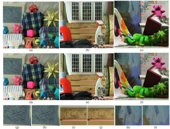
Fig. 5. Experimental results corresponding to the input images in Fig. 3. (a) - (c) the resultant image obtained by [2], (d)-(f) the resultant image obtained by the proposed algorithm, (g), (i), (k): the magnified sub regions corresponding to (a)-(c), respectively, (h), (j), (l) the magnified sub regions corresponding to (d)-(f), respectively.

In order to evaluate the performance of the proposed algorithm, the Middlebury stereo test images [14] were used in our experiment. The depth images were obtained using the stereo matching algorithm [10] as shown in Fig. 3. The pixel values of the color images were then divided by 4 to simulate low-contrast input images. Using the same histogram partitioning and mapping curve generation methods in [2], the effectiveness of the proposed algorithm can be evaluated by comparing the results obtained with and without modifying the histogram sub-intervals, respectively. Fig. 4 shows that the layer labeling result S_{1*} became more spatially uniform as \lambda increased. We empirically found that \lambda=1000 performed well in enhancing the contrast of images. The results given hereafter were obtained using \lambda=1