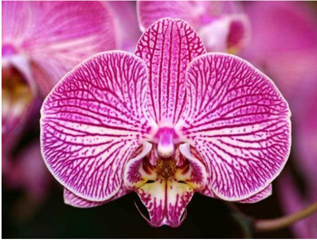
Phal Sogo Beach (Leopard Prince x Minho Prince)