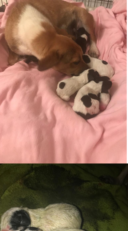
8 precious lives saved because of PAWS