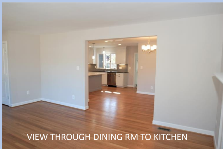
VIEW THROUGH DINING RM TO KITCHEN