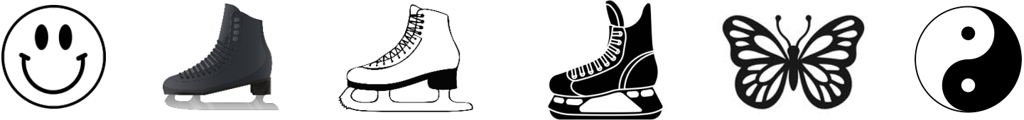
Image Selection (circle the image you would like) Only one (1) image per ad.