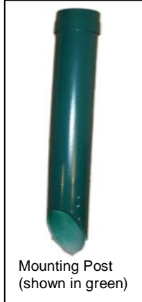
Mounting Post (shown in green)