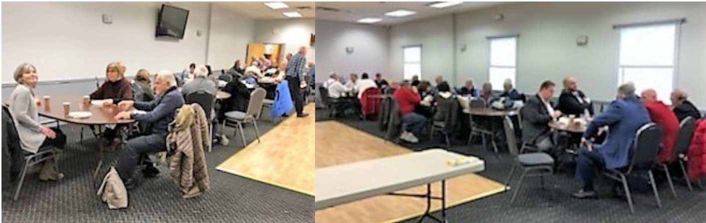
Brunch Back at the Council After Mass — Donated by Chapey and Sons Funeral Home