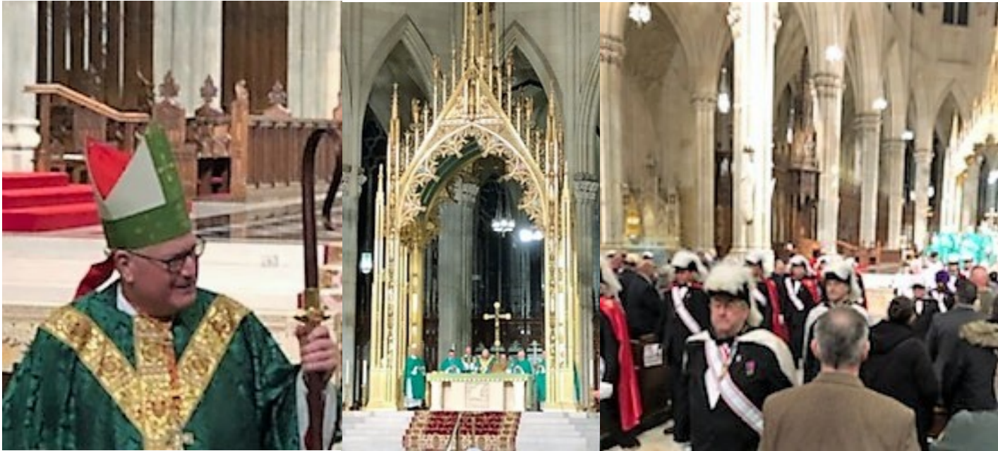
Cardinal Dolan St. Patrick's Alter 4th Degree Color Corps